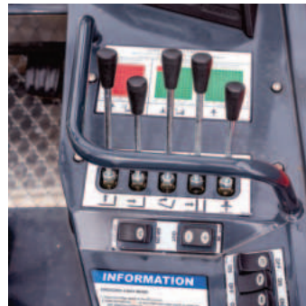
Conveniently located weather-resistant control switches