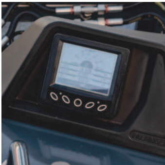
Digital display and easy-reach control levels with armrest