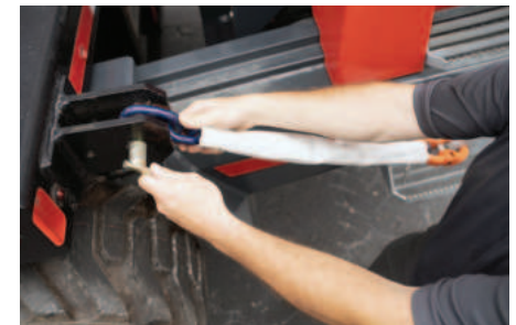
Unpin and stow the transport chains