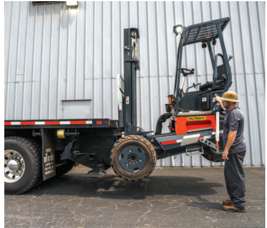
Lower the forklift and go...use the three switches to TILT, EXTEND and LOWER the machine to the ground

By eliminating operator slip and strain hazards from climbing on and off a truck-mounted forklift, PALFINGER's Ground Control System raises the standard in Operator Safety. Operators are no longer required to overextend themselves by trying to climb up on the forklift to dismount from the truck or trailer.