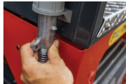
Retract and stow the suzie cable