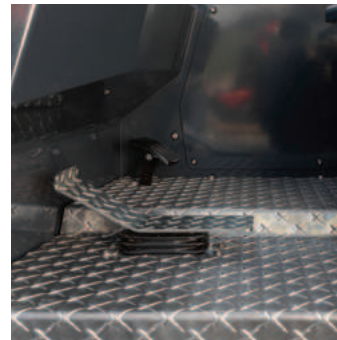
Ergonomically arranged foot pedals with ample floor space