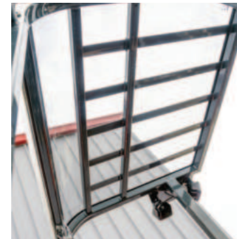
All-weather glass overhead guard cover