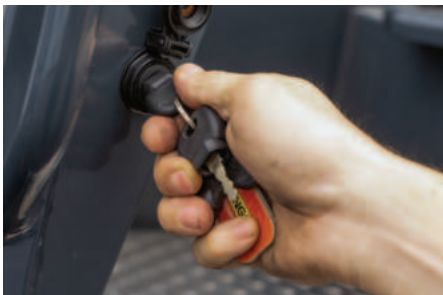
Start the engine with the ground level ignition key