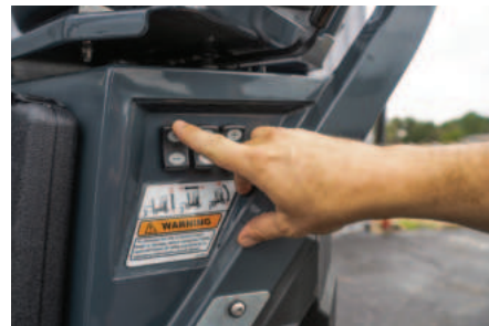
Relax the transport chains