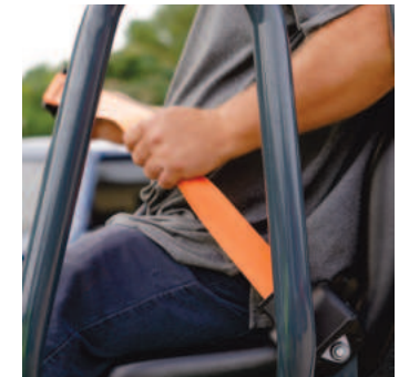
Deluxe seat with high visibility orange seatbelt and integrated side guard